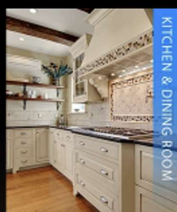
KITCHEN & DINING ROOM

Remove all clutter including tissue boxes, remote controls, and as many personal photos and items as possible. Floors should be swept and carpets vacuumed. If large area rugs cover beautiful flooring, remove the rugs. Also, hide all children's toys and portable cribs.